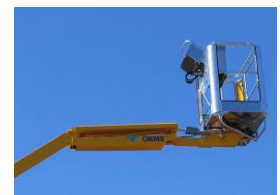
Fly jib (option)